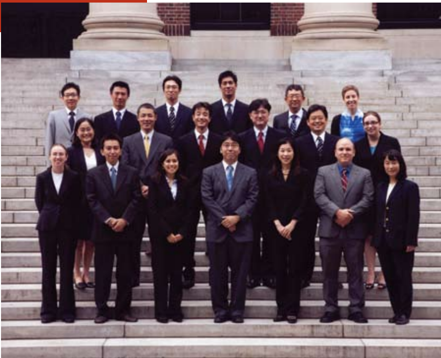
Program on U.S.-Japan Relations (2008–2009).