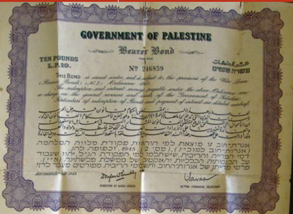
Photograph of a Government of Palestine Bearer Bond owned by a Palestinian family. The last coupon that the bond holder was able to redeem was on May 15, 1948, upon the termination of the British Mandate. The family continues to keep the bond certificate in the hopes of one day redeeming it fully.

Palestine-watchers, to understand why a high ranking minister of the Palestinian Authority (PA) would have felt the need to resort to such a desperate, and seemingly un-ministerial, act.