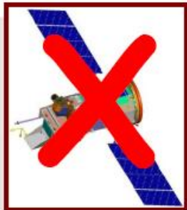
GLORY 3/4/2011 Aerosols, TSI