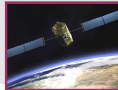
OCO-2 2013 ??? Global CO 2