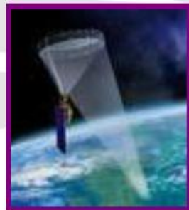
SMAP Early CY2015 w/CSA Soil Moist., Frz/Thaw