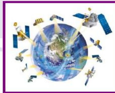
GPM 7/2013 ??? w/ JAXA; Precip