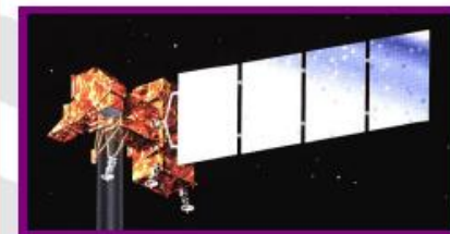
LDCM 12/2012 w/USGS; TIRS