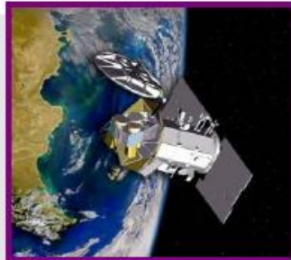
AQUARIUS 6/9/2011 w/CONAE; SSS