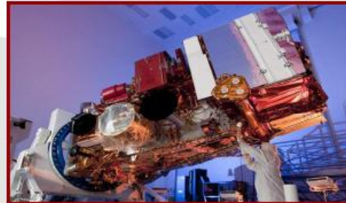
NPP 10/25/2011 w/NOAA EOS cont., Op Met.