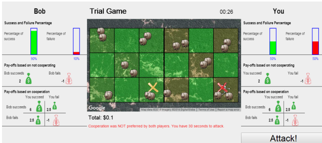
Figure 1: Hunters vs Rangers game interface

decisions about: i) whether they are inclined to cooperate with the other player or not and ii) which region of the park to put their snare (trap) where there is less chance of getting caught and also a high chance of capturing a hippopotamus. So the human subjects may decide to attack "individually and independently" or attack "cooperatively" with the other player. In both situations, they will attack different sections separately but if both of them agree to attack cooperatively, they will share all of their pay-offs with each other, equally (fifty-fifty). To enhance understanding of the game, participants were asked to play one trial game to become familiar with the game interface and procedures. Then we provided a validation game to make sure that the players have read the instructions of the game and are fully aware of the rules and options of the game. Finally, the third game which is the main game is shown to the human subjects and their decisions are recorded. Then we analyze the human subject decisions to derive a more accurate model to describe the human adversary behavior in security games in presence of cooperation mechanism.