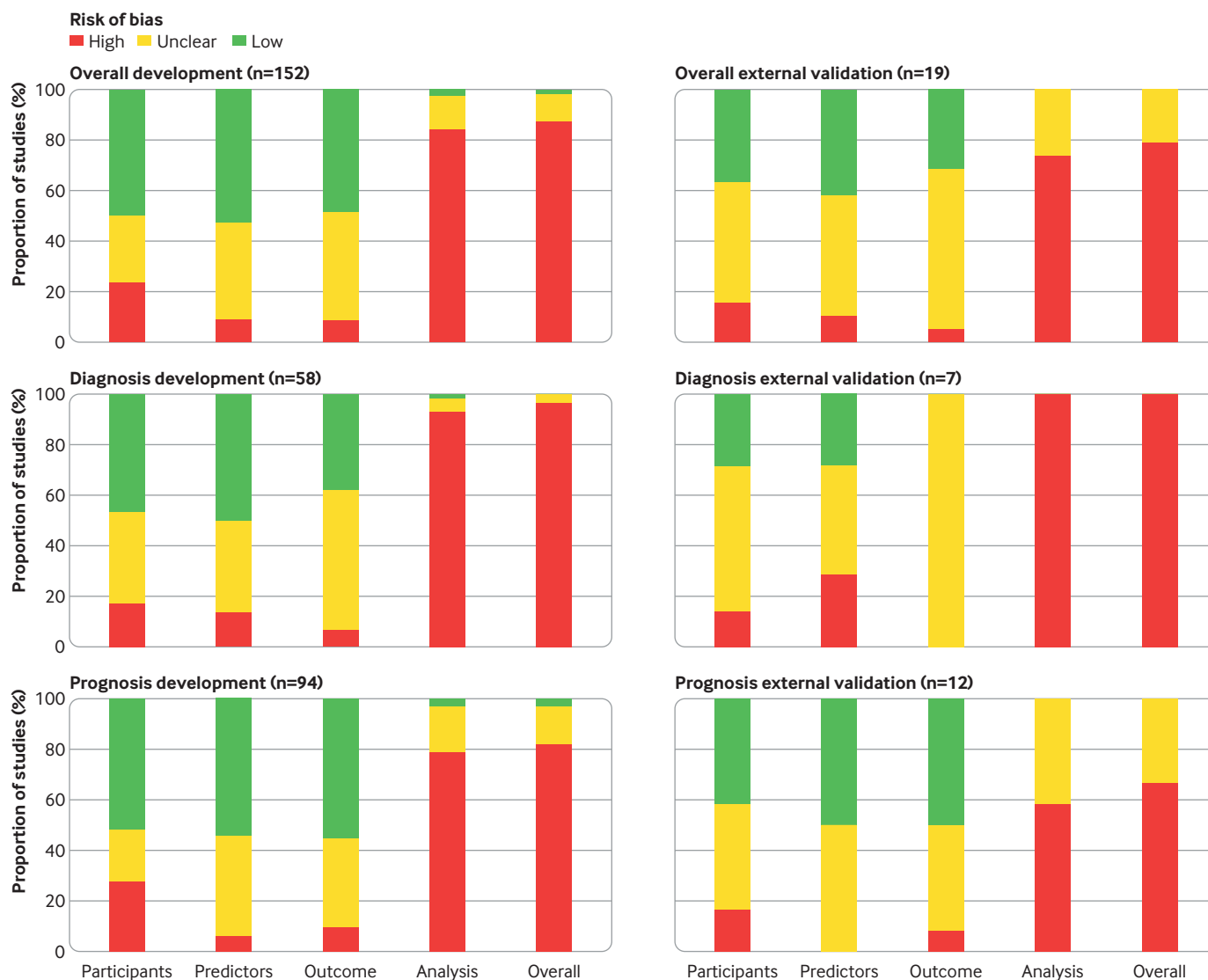
Fig 2 | Risk of bias of included studies (n=152) and stratified by study type

were omitted from the analysis or the imputation method was flawed) in 62/152 (41%) developed models and 7/19 (37%) external validations. Overall, 28/152 (18%) developed models used univariable analyses to select predictors (signalling question 4.5). It was not possible to assess if censoring, competing risks, or sampling of control participants (signalling question 4.6) was considered in 54/152 (36%) developed models and 7/19 (37%) external validations. Similarly, the reporting of relevant model performance measures (eg, both discrimination and calibration) (signalling question 4.7) was missing in 91/152 (60%) developed models and 13/19 (68%) external validations. Seventy six (50%) developed models accounted for model overfitting and optimism (signalling question 4.8).