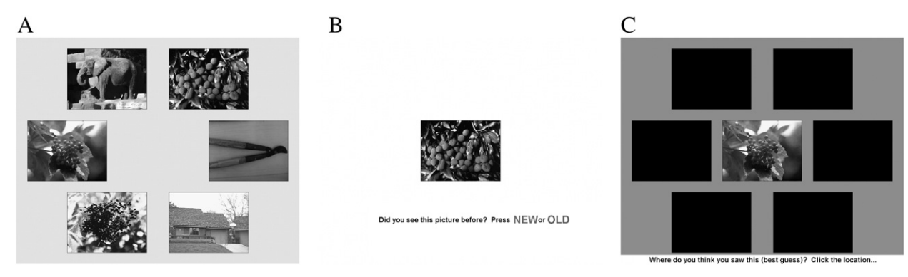
Fig. 1. (A) Sample learning array, (B) identity probe and (C) location probe.

the image was not visible, as the center of the screen was a candidate location for the location memory question. For Study 3, the test-phase tasks were blocked such that subjects completed a location memory task on the old image set, followed by an identity memory task on the full set of images (new and old). For Study 4, the tasks were interleaved, but subjects received feedback on each identity memory response and were then prompted for a location memory response for each old image.